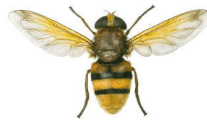
Hornet mimic hoverfly